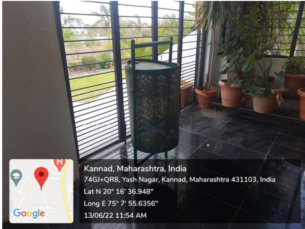
3. Green Dustbin for collection of solid waste