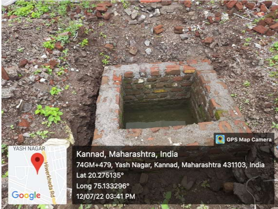
9. Hazardous chemicals