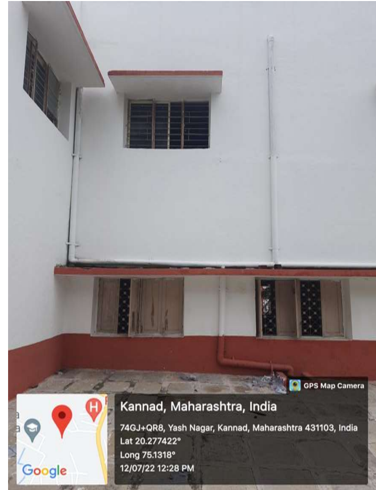
8. Liquid Waste