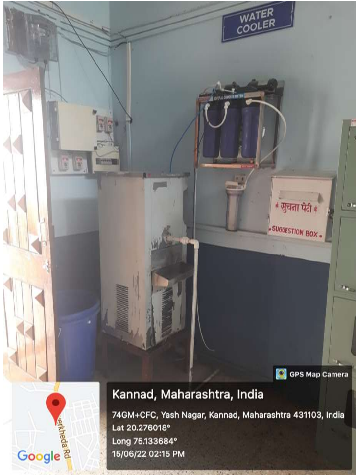
11. Waste Water for plants