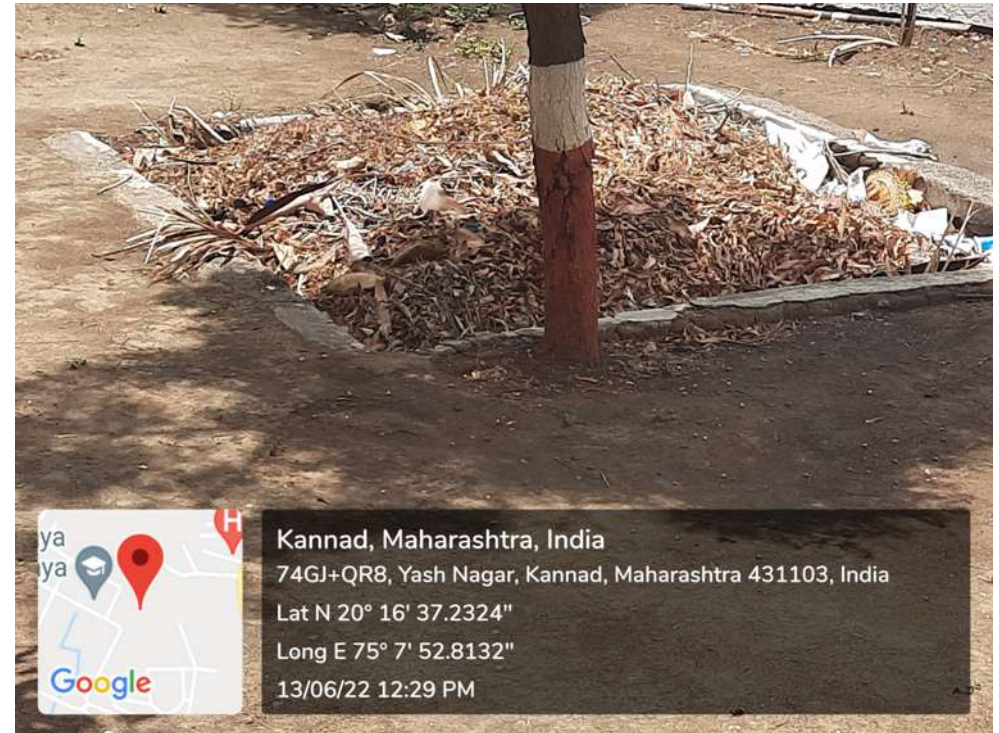
4. Solid Waste Collection pit