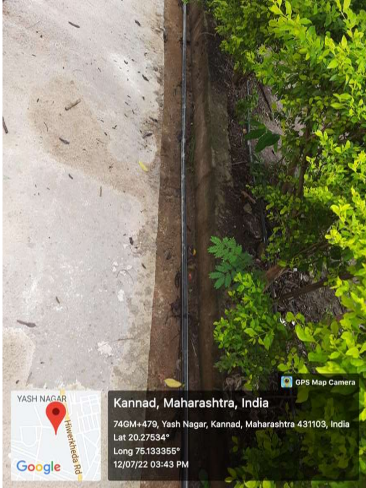
WhatsApp Image 2022-07-12 at 3.52.59 PM