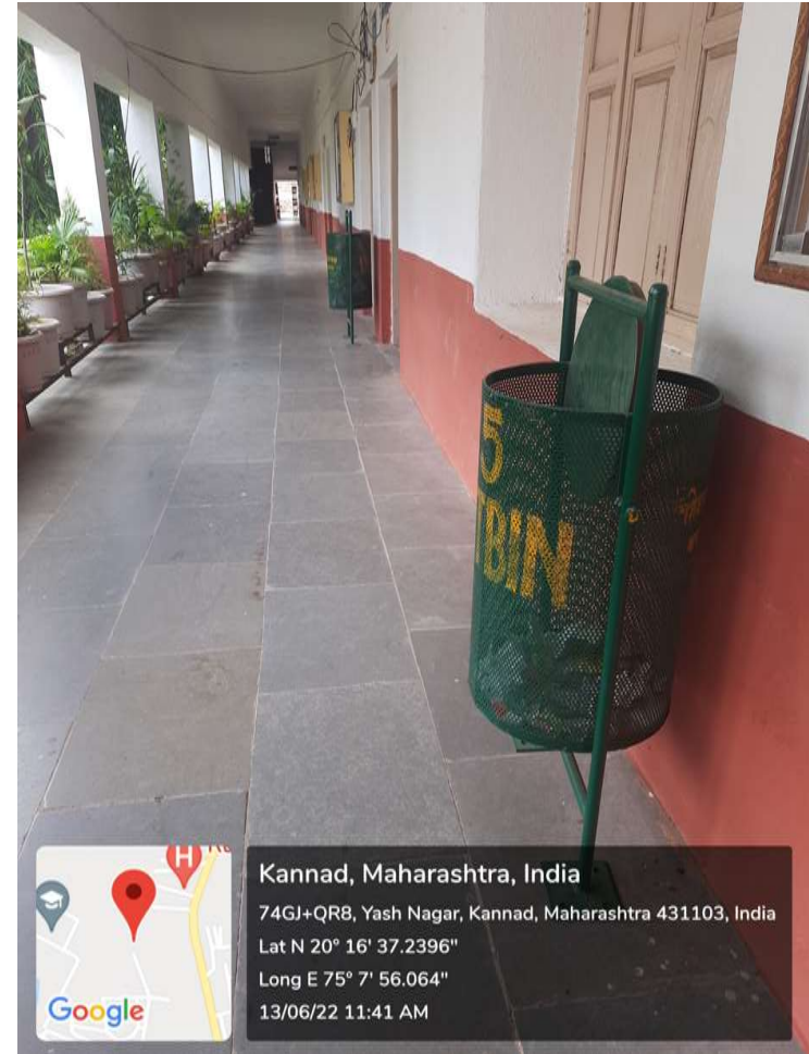
2. Green Dustbin for collection of solid waste