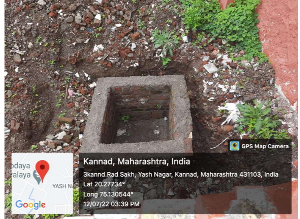
10. Hazardous chemicals