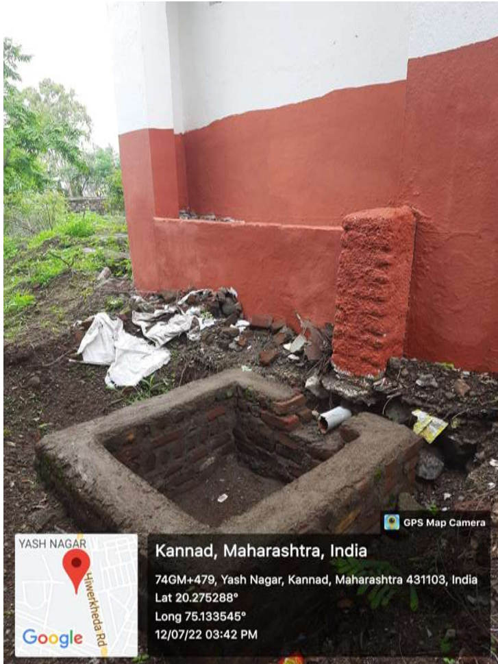
7. Liquid Waste