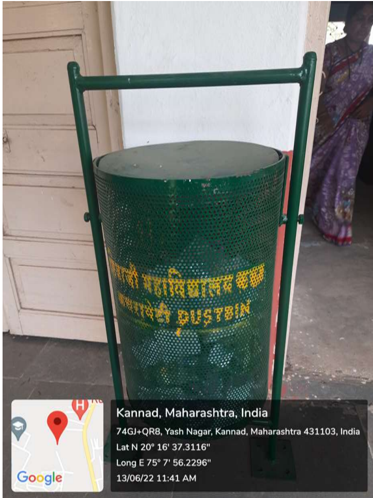
1. Green Dustbin for collection of solid waste